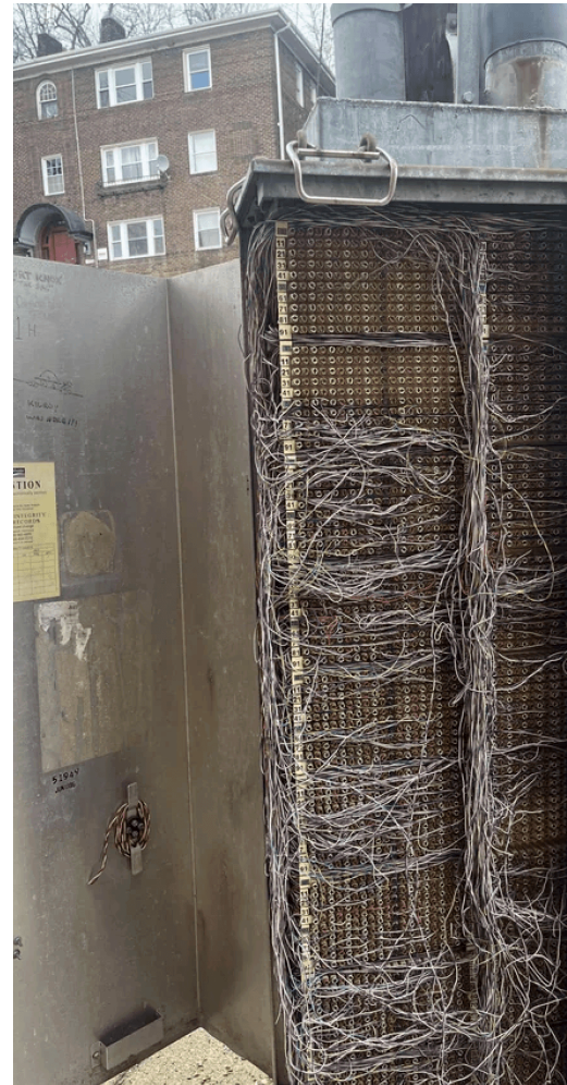
The inside of a cross-connect cabinet in a metro area

Failing to act doesn't just threaten business operations—it puts people at risk. As a technology advisor you have an opportunity to make sure customers are aware of their